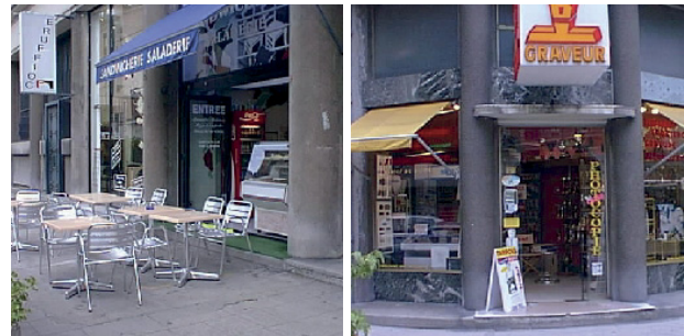
FIGURE 1. Examples of photographs used in the natural/urban categorization task and in the indoor/outdoor categorization task.

illuminated room. The luminance of the gray background was 56 cd/m 2 , measured by a photometer (CS 100; Minolta, Paris, France).