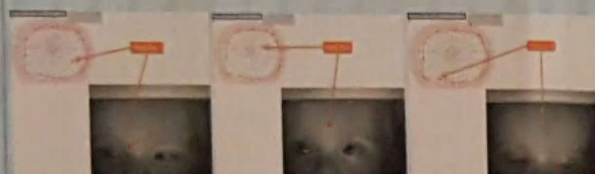
2 yo -> Glioma

BACKGROUND : Visual development delay, BCVA impossible to take